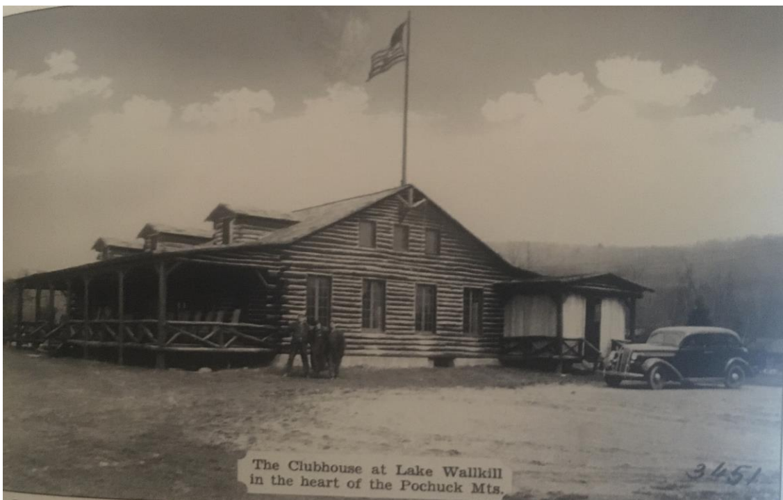
Community Clubhouse circa 1930 1 Clubhouse Road

Clubhouse rentals include the interior "great room" and the back porch with options to use the adjacent lawn area beyond the back porch. Please consult the fee schedule for the rental pricing for the different options.