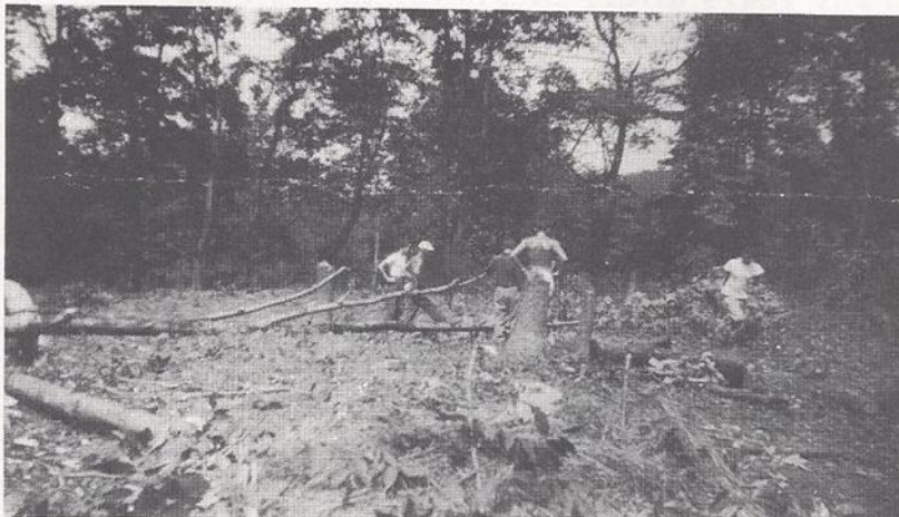
Baseball Field Construction circa 1947

In early spring of 1948, the Lake Walkkill Club purchased the backstop which still stands today. They also had the playing field regraded and planted grass seed.